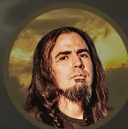
Francesco Pinter Guitars