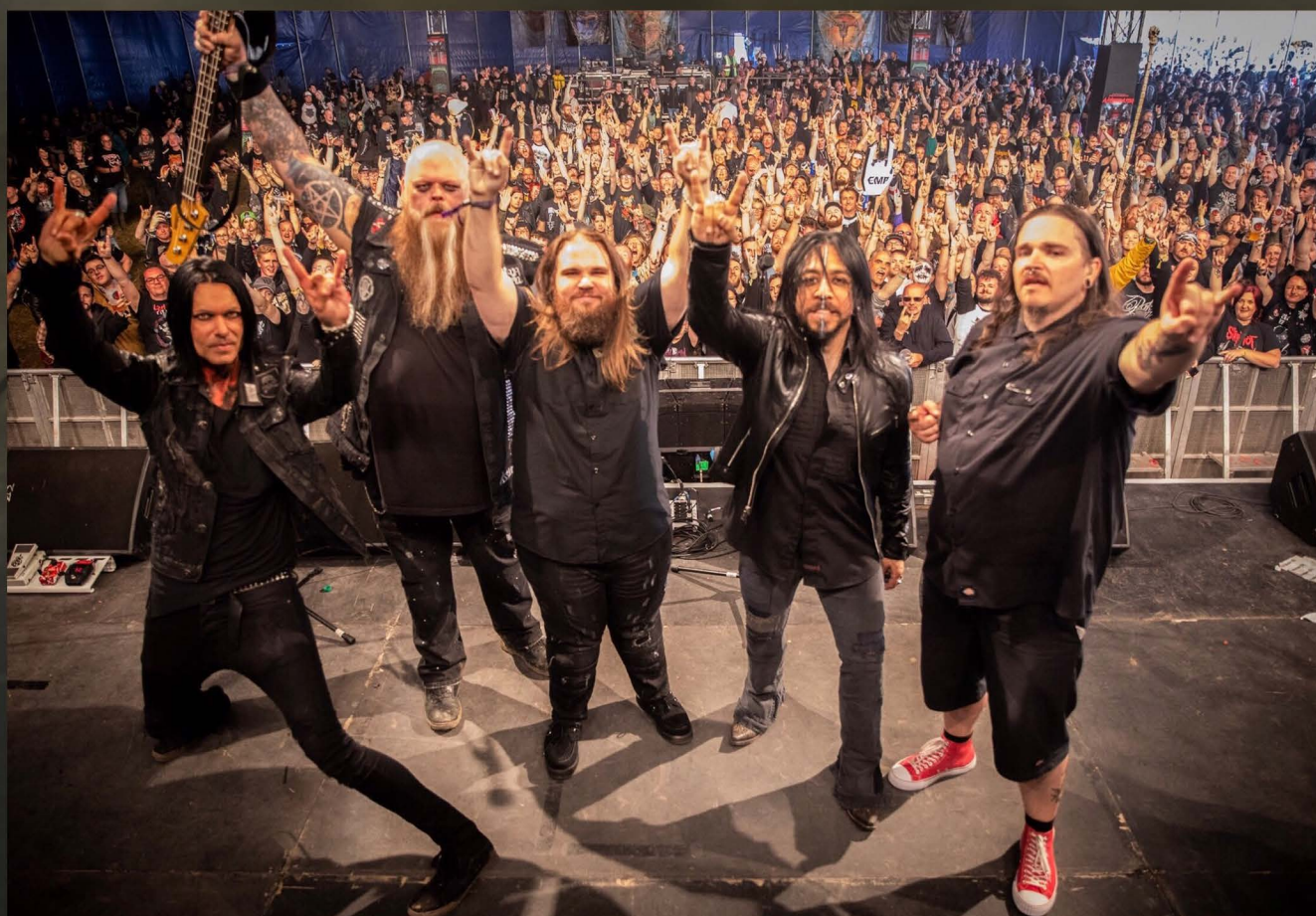
Johnny Ray performing at Bloodstock Festival UK